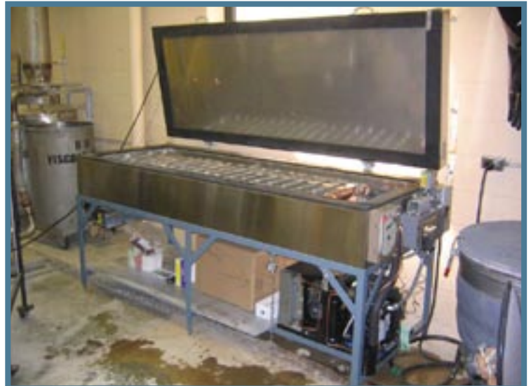
Solomon Lab Freeze/Thaw Chamber

Samples were tested according to the appropriate ASTM or French standard method for Freeze/Thaw Durability. ASTM C 666 – 97, Procedure A, was used for the samples tested at MTSU, Solomon, and Stork labs. For Procedure A, each sample was subjected to water during the freezing and thawing cycles. Samples were moist cured for 14 days. An initial measurement was then taken at 40°F. Samples were cycled from 40°F to 0°F and back to 40°F. At intervals of 36 cycles or less, the fundamental transverse frequency was determined for each specimen. Fundamental transverse frequencies were measured by the use of a sonometer with an oscilloscope resonance frequency tester according to the specifications listed in ASTM C 215.