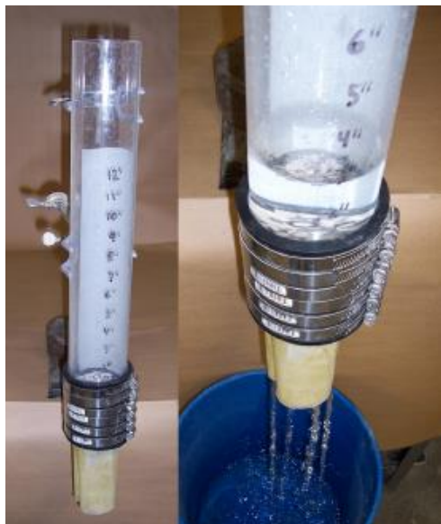
Pervious Concrete Permeameter