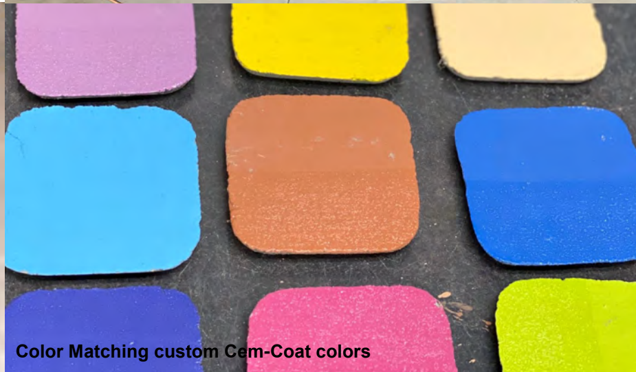
Color Matching custom Cem-Coat colors