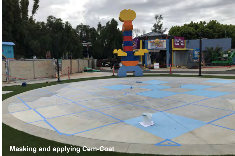
Masking and applying Cem-Coat