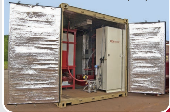
ColorSelect® Containerized Liquid System

For a complete overview of the Color System along with Site Requirements, please contact your local Solomon Colors Representative.